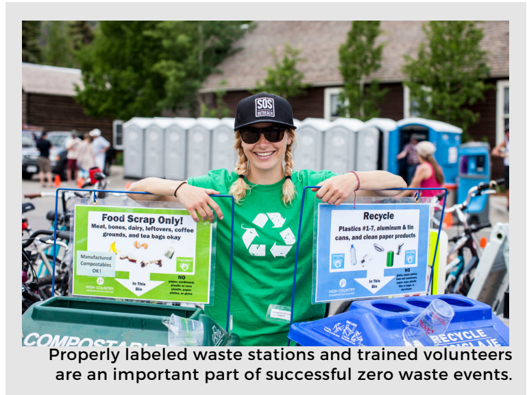
Properly labeled waste stations and trained volunteers are an important part of successful zero waste events.

Provides a variety of collection options for any size event; set-up, load-in, load-out of materials; collaboration with staff, vendors, and guests to reduce waste and contamination.